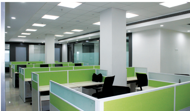
Pleasing Office Interiors