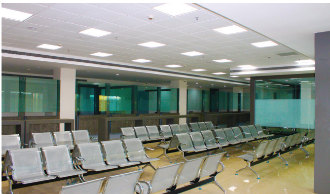
Spacious Service Centre