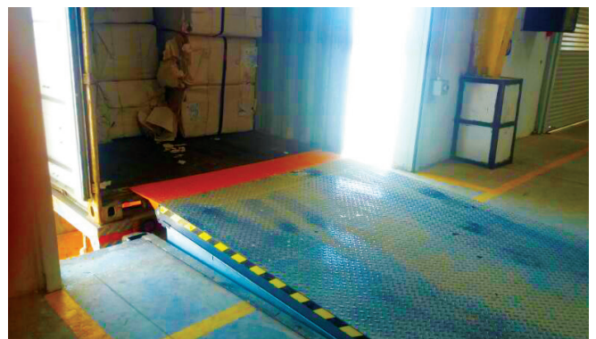
Automated Dock Levelers