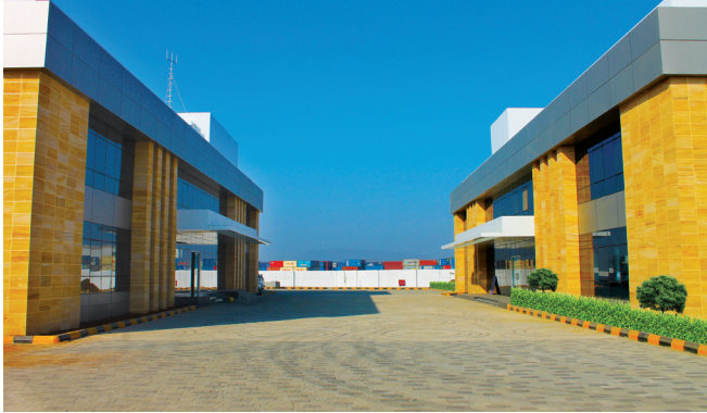
Swanky Office Building