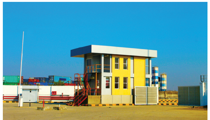
Smart Gate Complex